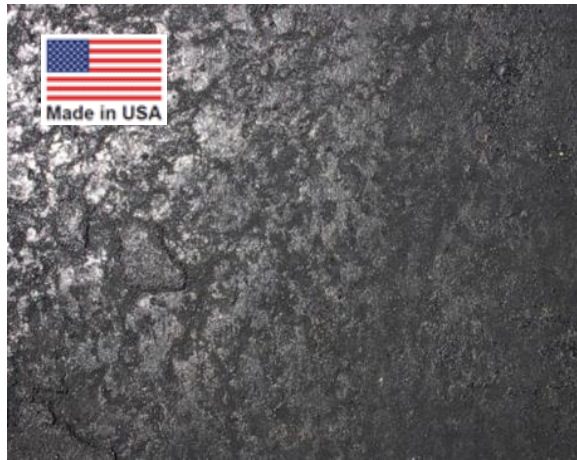
Top-Seal Black application in Central Texas

TSB was invented at the University of Texas at Austin. It is patented by the university and licensed to Eco Estates International, Inc. The product is uniquely adapted to a market in which there are very limited options for cost-effective alternatives to an asphalt wearing surface.